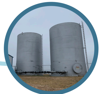
3: Storage Tank