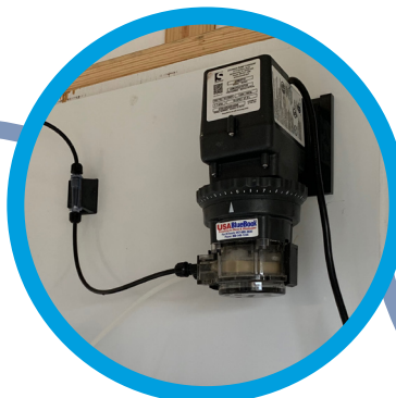
Step 2: Chlorination