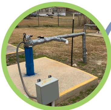
Step 1: Well

Once the water has been cleaned, it goes into a ground storage tank and is ready for you to turn on your tap.