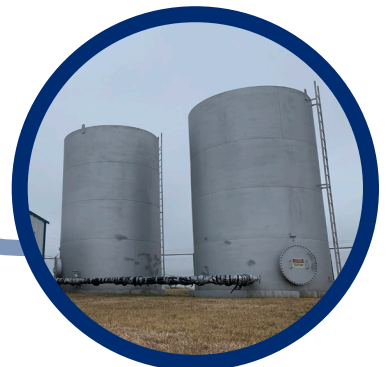
Step 3: Storage Tank