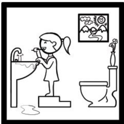
Brushing teeth with faucet on, using more water than needed.