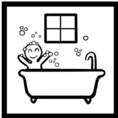
Bath faucet is off.