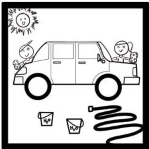
Washing car with hose off when not needed and using buckets to rinse car.